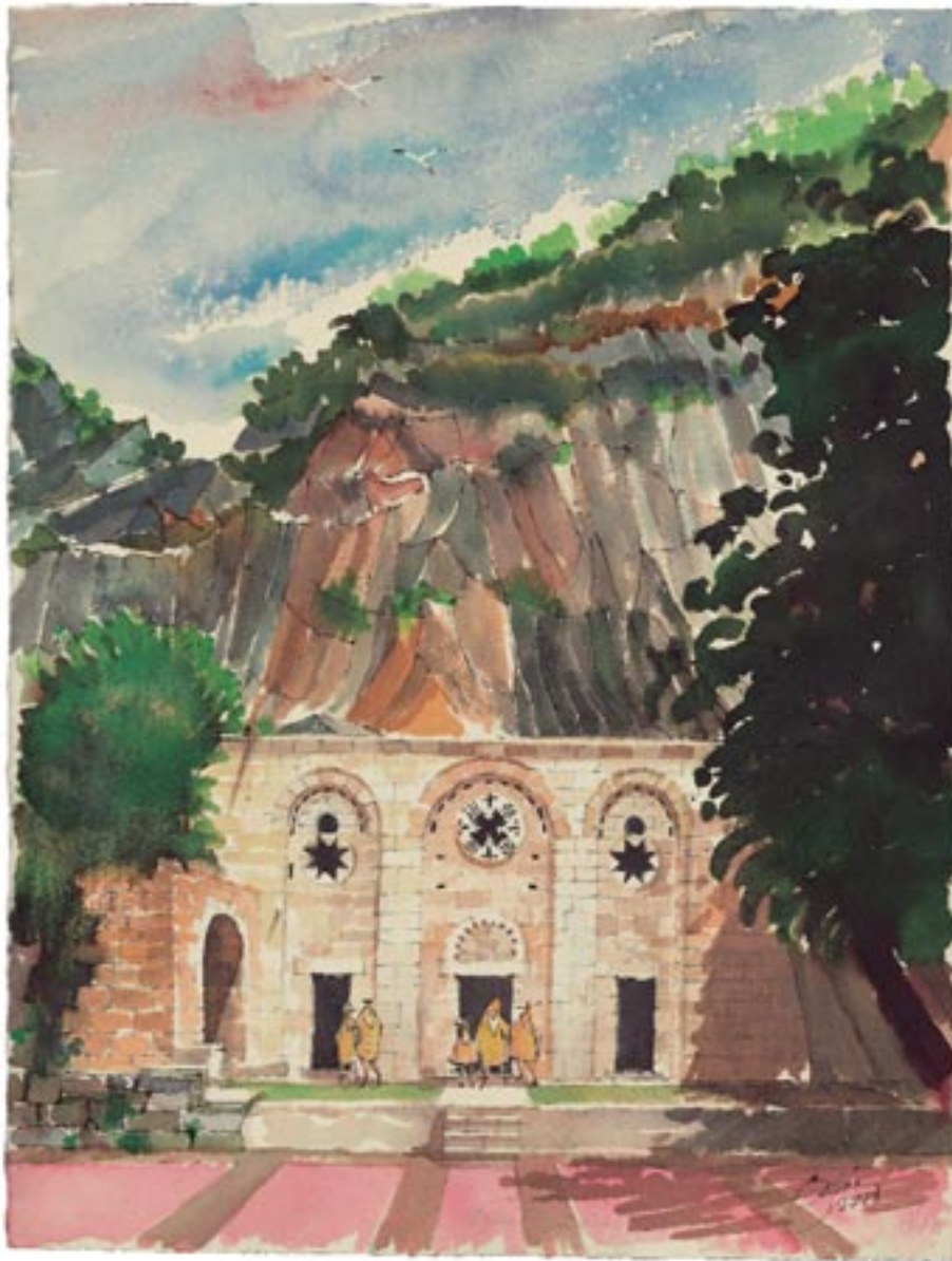
St. Peter's Church in Antakya (Antioch)

Carved into a rocky hillside, the earliest examples of churches in Christianity, and it serves as a museum now.