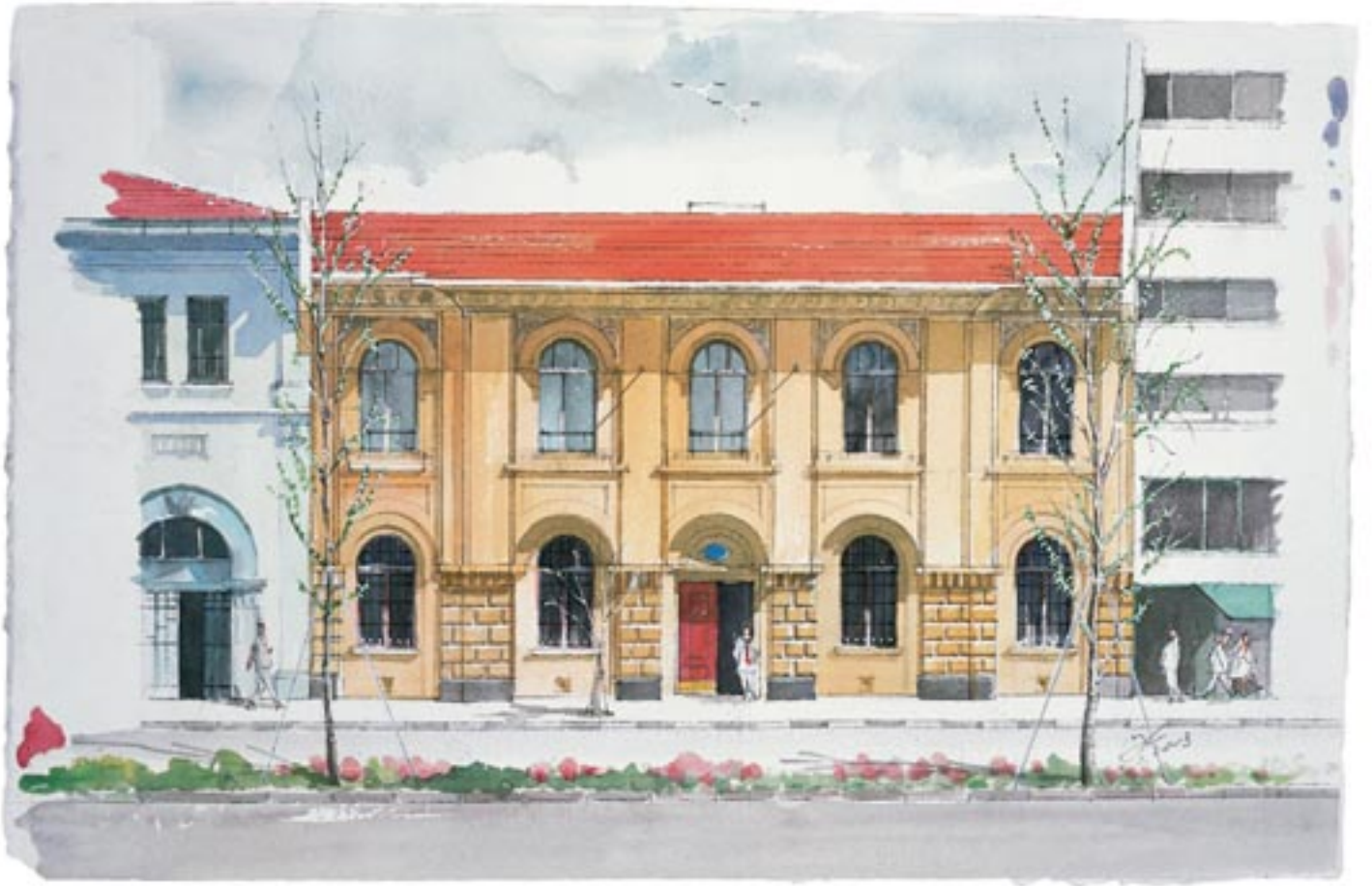
TEB Branch in İzmir

A neo-classical construction incorporating Art Nouveau elements both in its interior and exterior aspects.