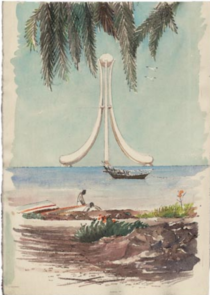
The Pearl Monument in Bahrain

A beautiful tower topped by a pearl now dominates the skyline of modern Bahrain, a commercial centre in the Persian Gulf.