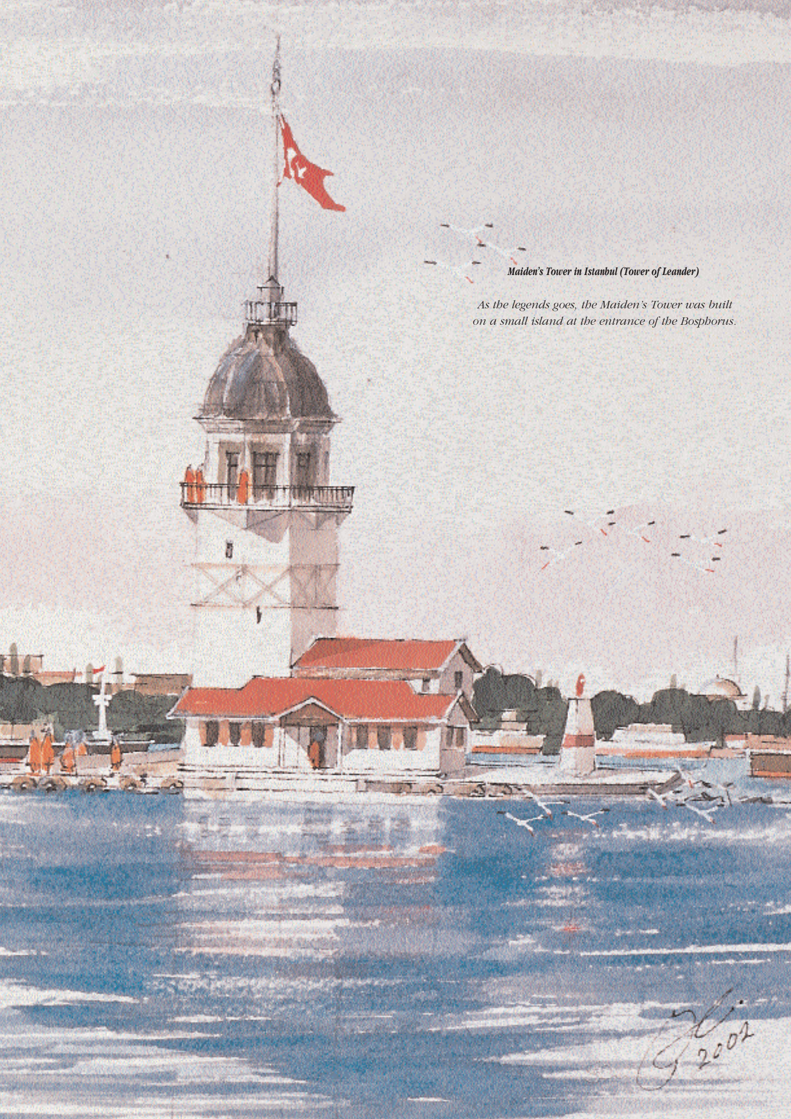
Maiden's Tower in Istanbul (Tower of Leander)

As the legends goes, the Maiden's Tower was built on a small island at the entrance of the Bosphorus.